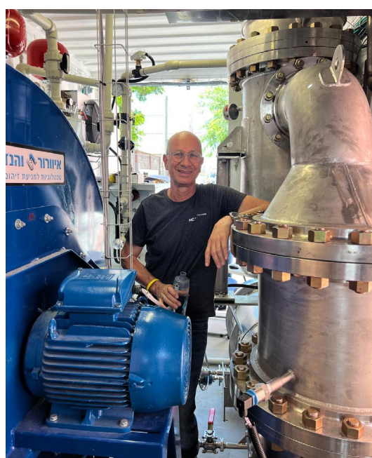
Commercial system: 1,000 Liters/day